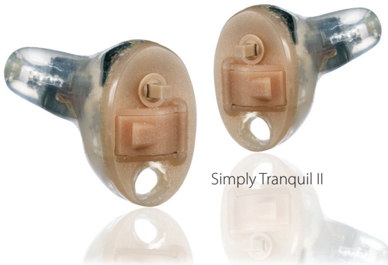
Simply Tranquil II